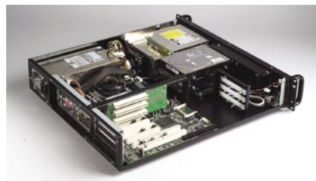
The inside view of ACP-2320MB