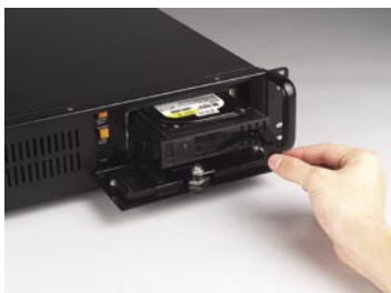
Dual easy-to-maintain SATA HDD trays