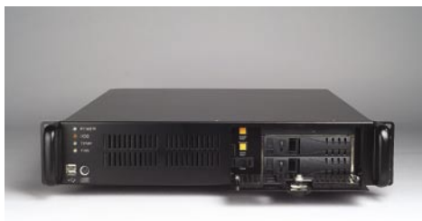
The front view of ACP-2320MB

* The riser card is specially designed to support Advantech AIMB-700 series motherboard. There might be compatibility issue with other vendor's motherboards.