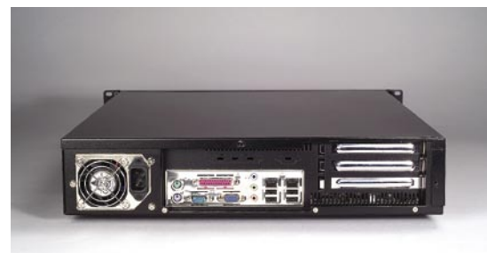
The rear view of ACP-2320MB