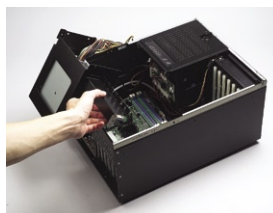
Power supply bracket with hinges