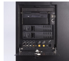
One slim CD-ROM drive, two 3.5" disk drives and two mobile SATA HDD trays