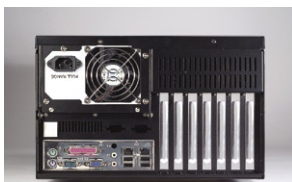
Bottom view of IPC-7143