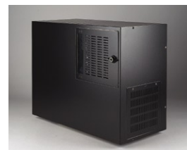
Bi-directional wall-mountable design