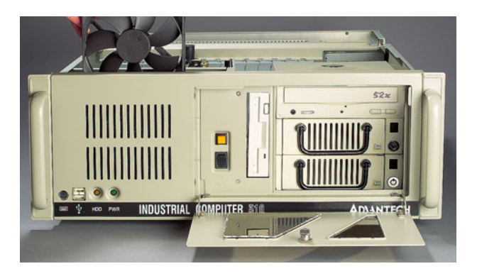
Figure 2-2 Front Panel Section

Refer figure 2-2 to find USB, PS/2 keyboard connector, system power and HDD LED, power switch and system reset location.