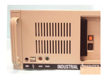
Figure 2-3 Cooling fan & filter