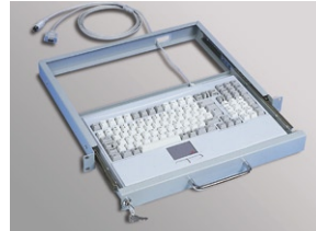
KBD-6312 Rackmount Keyboard with Touchpad