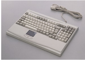
KBD-6307 105-key Keyboard with Touchpad