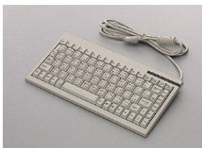
KBD-6304 Compact 88-key Keyboard