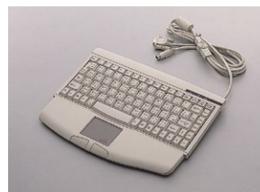
KBD-6305 Compact 88-key Keyboard with Touchpad