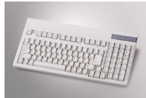
PCA-6302 Compact 104-key Keyboard